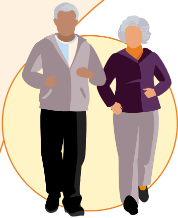
Make it social