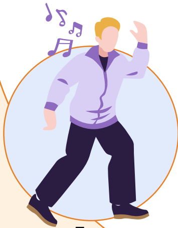
Try something new