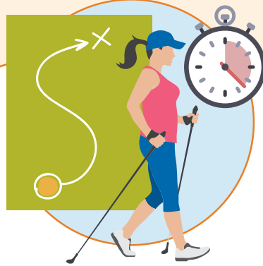
Break down an activity into its parts