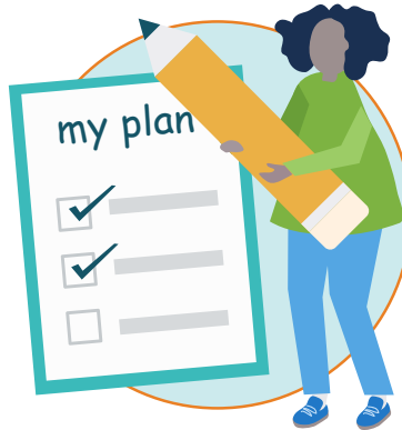
Make a plan